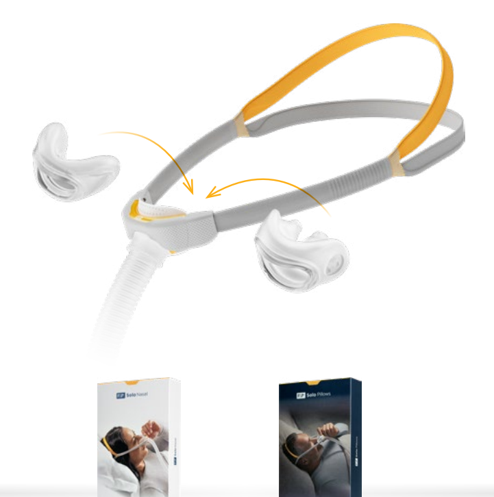
F&P Solo Nasal (sits under the nose)

The AutoFit headgear is interchangeable with F&P Solo Pillows and F&P Solo Nasal cushions. These cushions can be purchased separately.